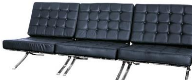
Barcelona 3 Seat Sofa