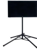
42" Flat Screen & Floor Stand