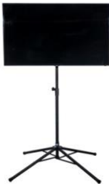
65" Flat Screen & Floor Stand