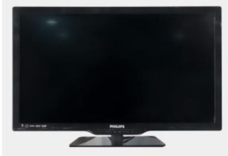
32" Flat Screen Per Day