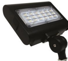
LED Light On Stand