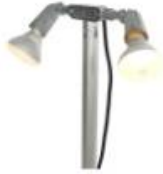
Double Head Light on Stand