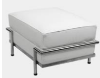
Contemporary White Leather Ottoman