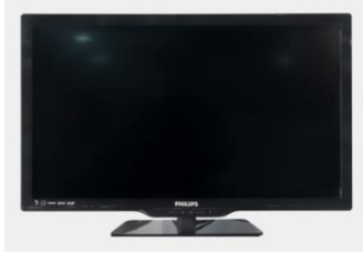
32" Flat Screen Per Day