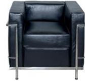
Contemporary Black Leather Love Seat