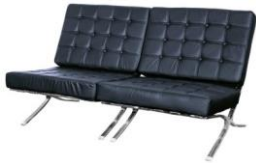
Barcelona 3 Seat Sofa