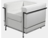
Contemporary White Leather Love Seat