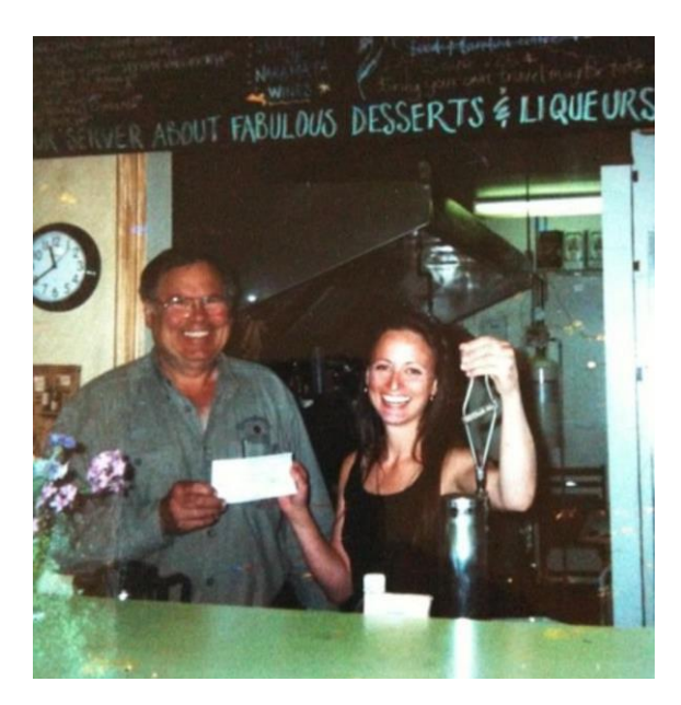
First keg customer in 2001